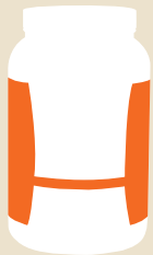
BulaFIT KetoFUEL Vanilla

Ready to add some flavor to your ketogenic lifestyle? KetoFUEL makes eating (or drinking) keto simple with perfectly formulated fat/protein/carb ratios. Mix in a BulaBOOSTER to add delicious flavor and high-impact health benefits. It's keto made easy... and tasty!